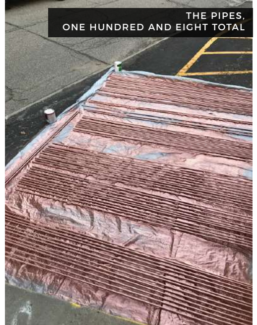
THE PIPES. ONE HUNDRED AND EIGHT TOTAL