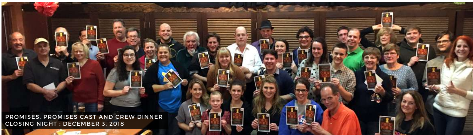
PROMISES, PROMISES CAST AND CREW DINNER CLOSING NIGHT : DECEMBER 3, 2018