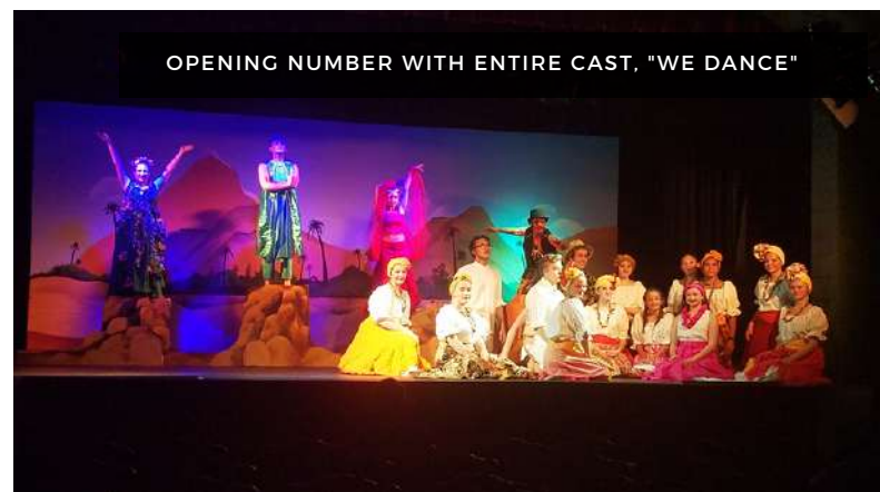
OPENING NUMBER WITH ENTIRE CAST, "WE DANCE"

"For all the ones we leave, And we believe Our lives become, The stories that we weave"